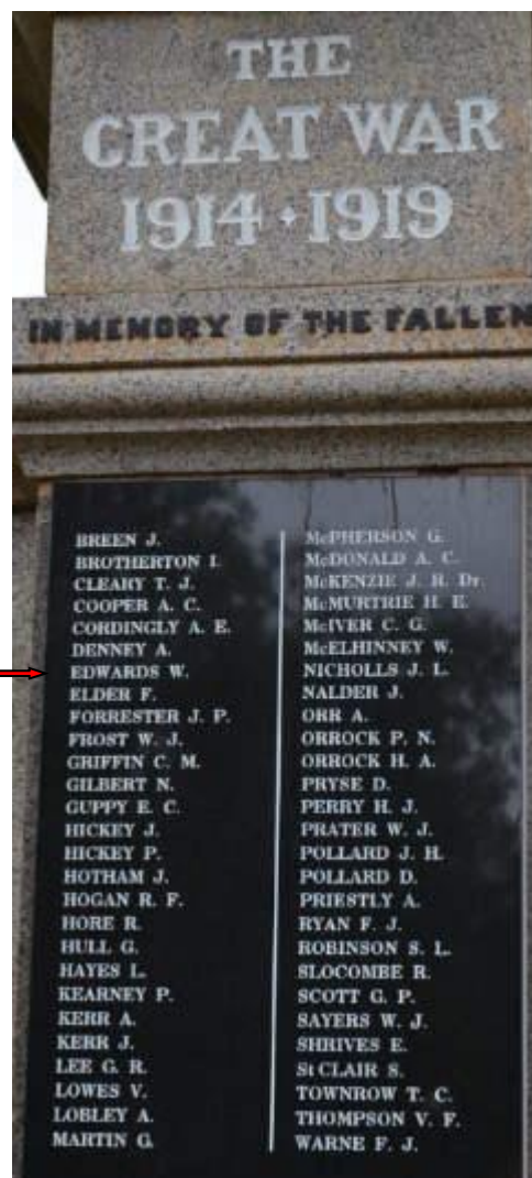
Wycheproof War Memorial