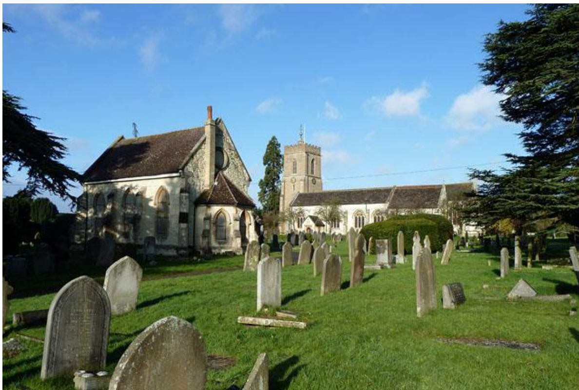
Reigate Cemetery Chapel and St Mary's Church

Reigate Cemetery, Reigate, Surrey contains 55 Commonwealth War Graves – 52 relate to World War 1 & only 3 are from World War 2.